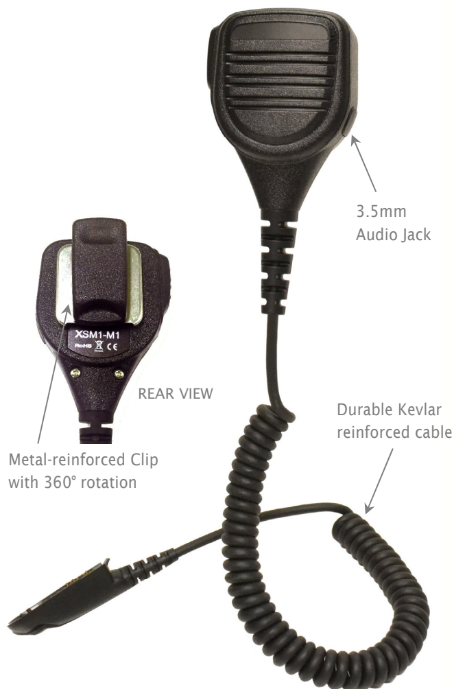
Metal-reinforced Clip with 360° rotation