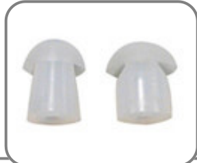
Part#: SEC-MTS, SEC-MT Standard Mushroom Tips - Regular and Small