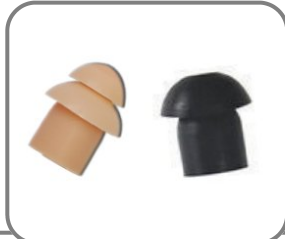
Part#: SEC-FT, SEC-MT-B Flanged Tip - Tan and Mushroom Tip in Black