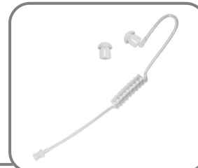
Part#: AT-CLK Kit - includes clear airtube, locking adapter, 2 eartips