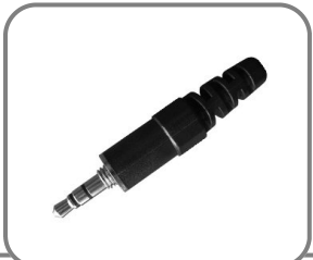
Connector: 3.5SC 3.5mm straight threaded stereo connector