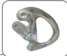
Part#: EP-XX Single Ear mold Insert Left/Right Side- S, M, L