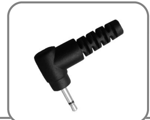
Connector: 3.5 3.5mm right angle mono connector