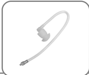
Part#: AT-CLSK Kit - includes short clear air tube, screw, ear tip