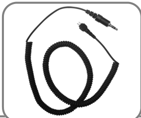
Part#: AT-CBL Replacement Cord for XLA, long cord.