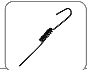
Part#: AT-BL Replacement air tube only - Black