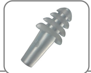
Part#: SEC-CT COMTIP, NRR 21 Noise Attenuating Ear Tip