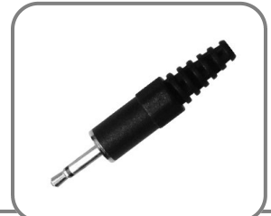
Connector: 3.5S 3.5mm straight mono connector