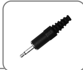
Connector: 2.5S 2.5mm straight mono connector