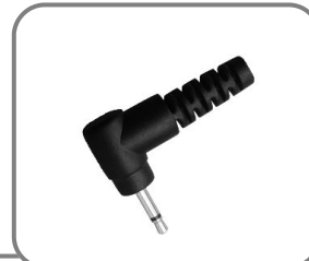
Connector: 2.5 2.5mm right angle mono connector