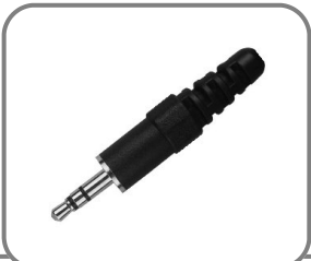
Connector: 3.5ST 3.5mm straight stereo connector