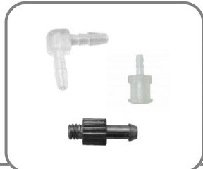
Part#: Various Angled Elbow, Air Tube Screw & Locking Adapter