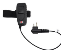
BLUE-X Bluetooth Dongle