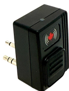
BLUE-X Bluetooth Unibody Adapter