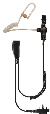
Full View with connector