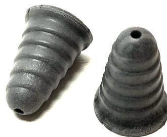
COMTIP "SKULL SCREWS"

PART#: SEC-CT2 2-Flange, Push-in, Reusable Order Quantities: 10, 100 Certified: NO, NRR: Not Rated COLOUR: Tan Material: Polymer